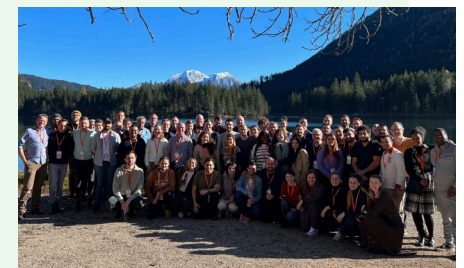
Behold Europe gathering 2022

The aim of Behold Europe is for mutual encouragement, equipping and envisioning as we meet together. We believe such gatherings are a catalyst for accelerated Gospel proclamation, enhanced co-operation in ministry, and the raising of more evangelists at this critical time. We also plan to open this event to applications from any young evangelists across Europe who might be interested.