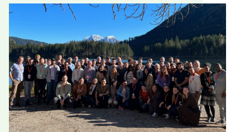
Behold Europe gathering 2022

The aim of Behold Europe is for mutual encouragement, equipping and envisioning as we meet together. We believe such gatherings are a catalyst for accelerated Gospel proclamation, enhanced co-operation in ministry, and the raising of more evangelists at this critical time. We also plan to open this event to applications from any young evangelists across Europe who might be interested.